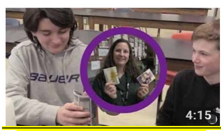
Middle School X-Block! https://youtu.be/67ndMCLKFWI