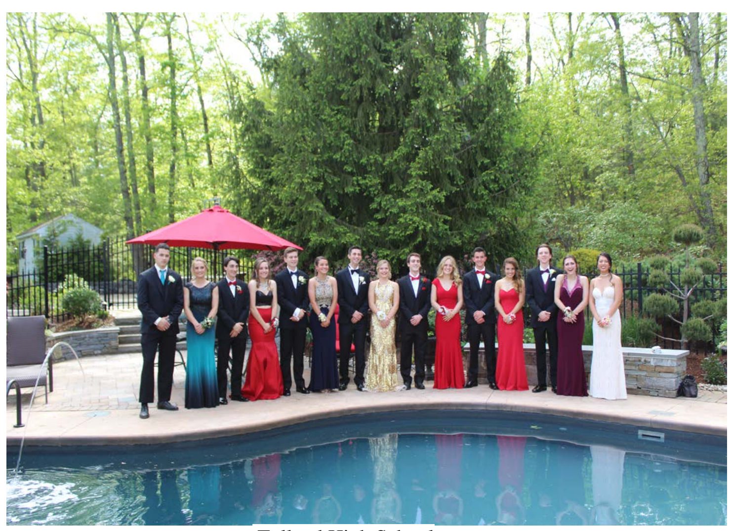
Tolland High School Students Enjoying the Prom