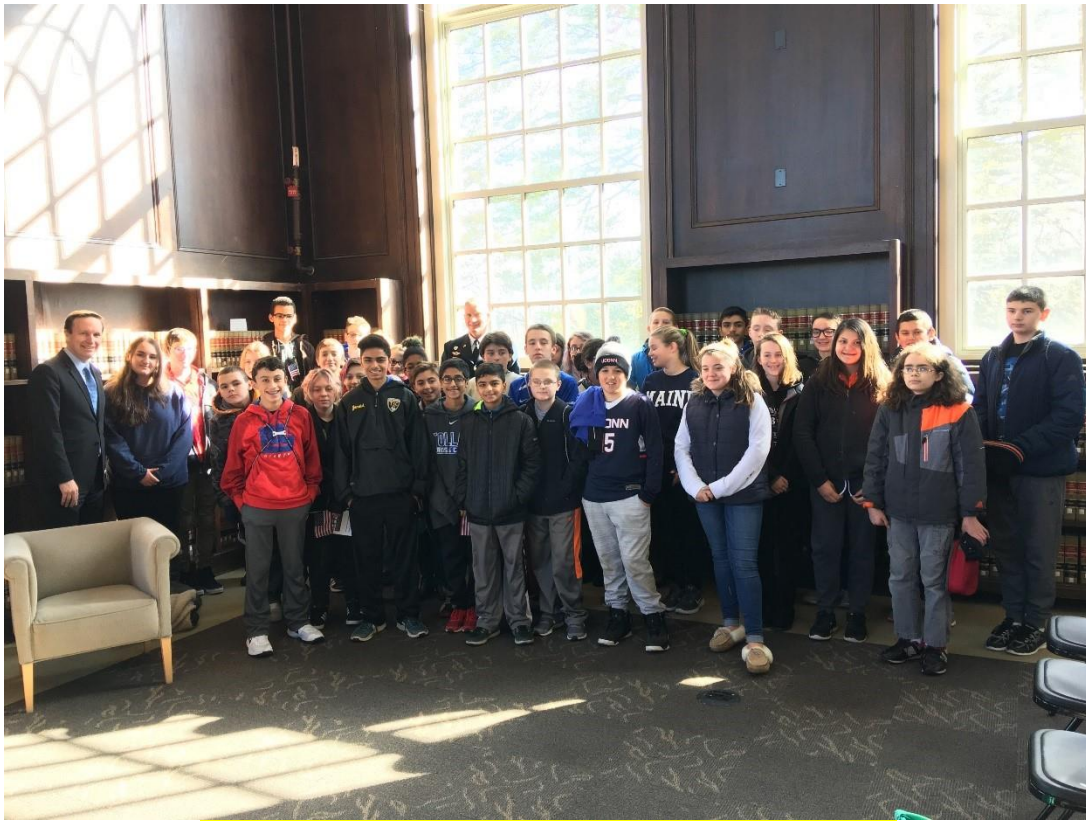
Birch Grove Veteran's Day Celebrations